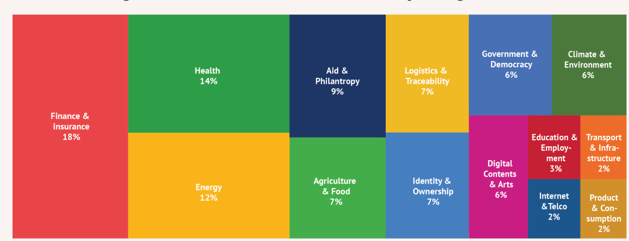
Figure 1: PositiveBlockchain Database by Categories