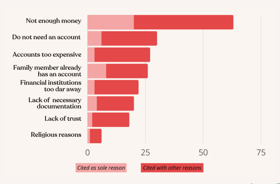
Figure 4: Reported Barriers (%) for Adults Without a Financial Institution Account, 2017

• High fees. Cost is another access barrier for many around the world. In the same survey, 26% of respondents cited high fees as a reason for lack of bank account access.<sup>48</sup>